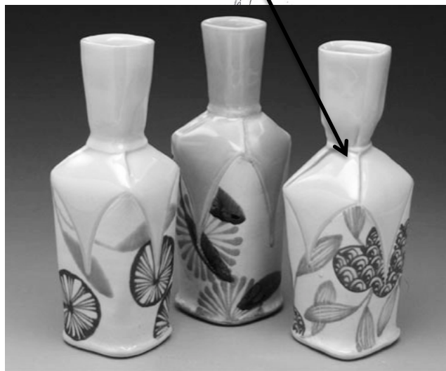
I use a series of single point darts on these bottle forms in order to shape the shoulder