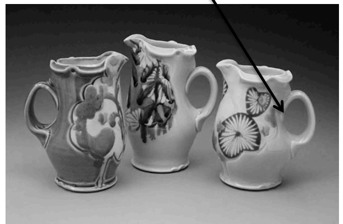
One double pointed, leaf-shaped dart is cut out of the back of these pitchers. The handle is then placed at the top and bottom of the points.